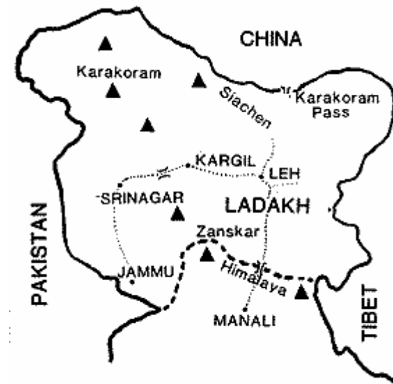
Figure 1: Ladakh on map